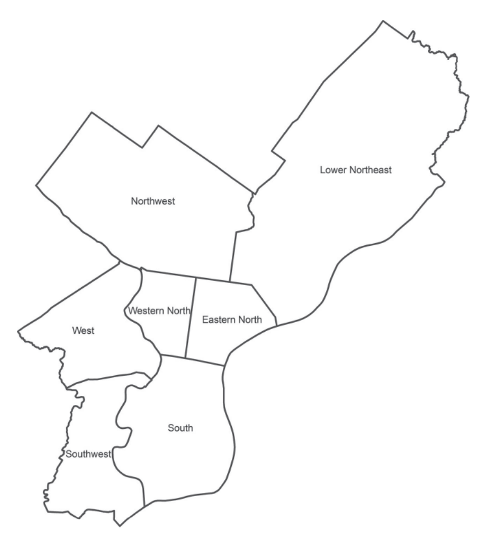
Figure 2. Regions derived from the Philadelphia City Planning Commission district boundaries used to investigate spatial nonstationarity.

zero farther from observation i . In the present study, GWR models were calculated using half mile, one mile, and two mile bandwidths. We used three different bandwidths simply to ensure that the results are consistent across bandwidths and are not an artifact of a specific bandwidth setting.