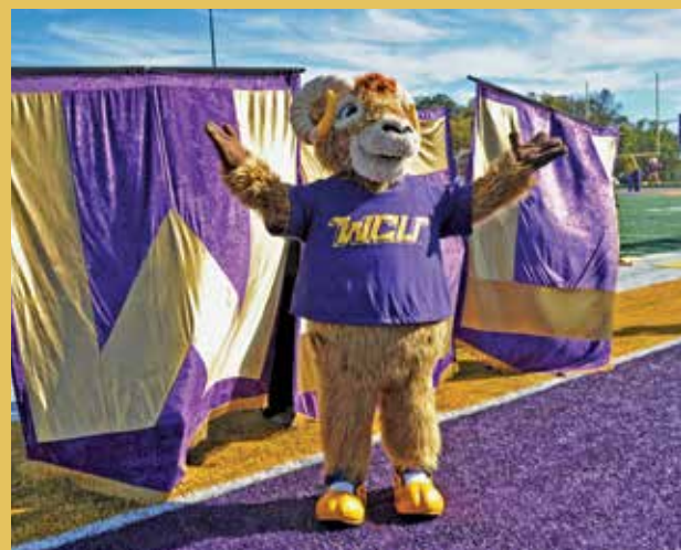
Rammy, WCU's beloved mascot, revealed a new look during Homecoming 2017. Last spring, students were asked for their thoughts about updating Rammy's looks in a way that would capture WCU's energy. Voices were heard and a dynamic iteration was developed as part of a campus-wide spirit campaign led by the Division of Student Affairs.