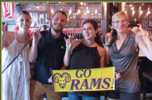
Golden Rams alumni in Avalon, NJ, for the 10th Annual Rams in the Sand.