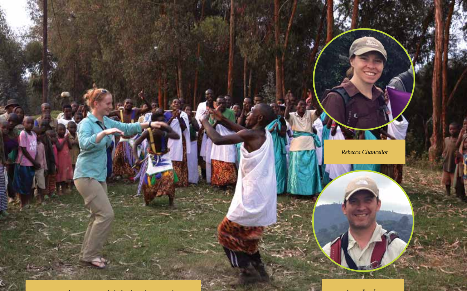
Dancing one of many times with the local people in Rwanda.