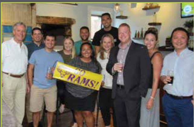
Chester County Alumni Chapter met at LaCabra Brewery in Devon to taste the new brew.