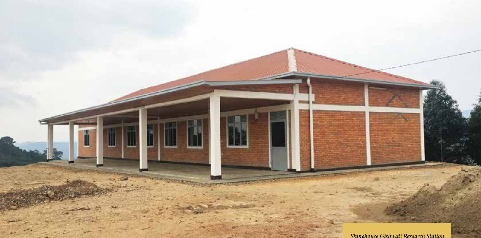
Shinehouse Gishwati Research Station