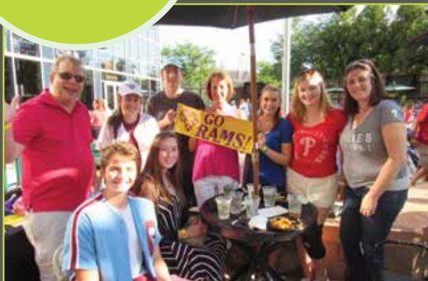
Nearly 100 alumni and friends enjoyed the Phillies game with Phireworks in July.