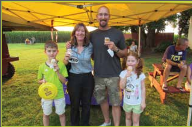
Alumni and their families enjoyed free ice cream while welcoming the Class of 2021 to WCU at the freshman send-offs in Pottstown and Chester Springs.