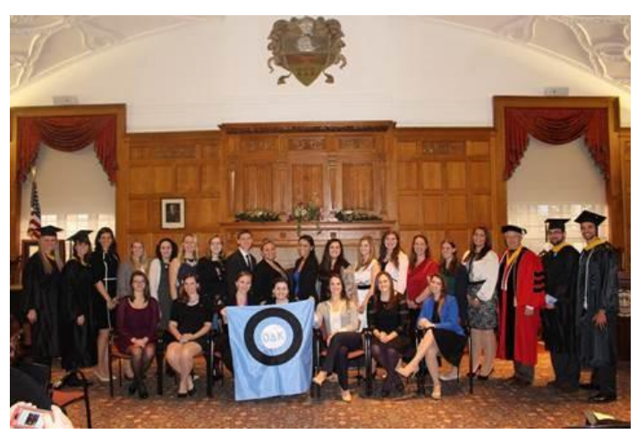
2014 Inductees to Omicron Delta Kappa