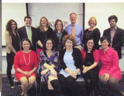
New Writing Institute Fellows