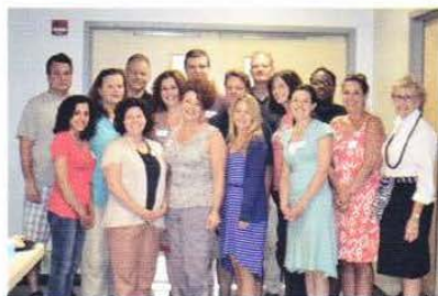
2013 PAWL P Writing Institute Lower Merion Teachers and me.

Fast forward through a career of 38+ years as teacher of English and/or supervisor of humanities teachers in five different school districts and not only do I keep the guiding principles of the National Writing Project in the forefront of all I do, but I also make sure that, to the best of my ability, I pave the way for teachers with whom I work to grow as I did through PAWL P. During my tenure as supervisor in Garnet Valley School District, I supported 69 teachers, from all content areas, to become Fellows and bring their newly acquired knowledge and enthusiasm back to their colleagues. Now that I am at Lower Merion School District, I am doing the same with the goal of having as many teachers as possible become confident teachers of literacy and thereby, developing a shared district philosophy around the teaching of quality writing. I cannot imagine teaching or working with teachers without the wisdom of the National Writing Project guiding me and the support of the PAWL P team right there beside me. I am not quite sure who I would be without that influence in my life.