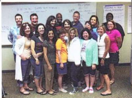
New Writing Institute Fellows

These new members of PAWLP are wonderful sources for the teaching of writing and reading. Be sure to ask them for their ideas!