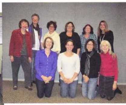
New Reading and Literature Institute Fellows