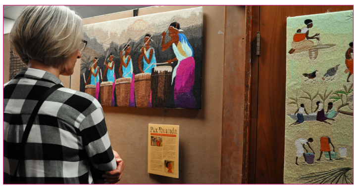
Visitor viewing embroideries of the women of Savane Rutongo-Kabuye, courtesy of Pax Rwanda Photo by Laura Preby

The museum is free and open to the public Monday-Friday, from 9AM to 4:30PM. For more information, visit www.wcupa.edu/museum