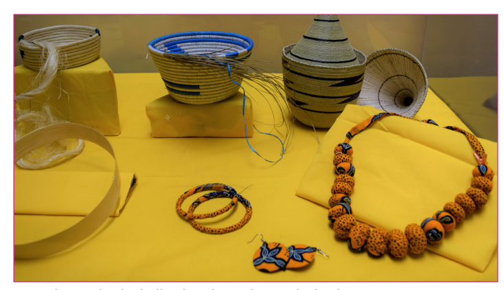
Rwandan crafts, including jewelry and Agaseke baskets

The museum celebrated its 10th student co-curated exhibit, as well as the formal opening of the Shinehouse Gishwati Research Station, WCU's new primate research station at Gishwati National Park in Rwanda. Although many people may associate Rwanda with its troubled colonial past and devastating genocide in the late 1990s, this museum exhibit focuses on